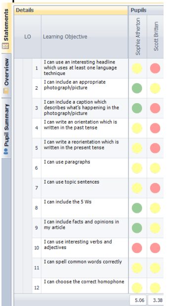
Mastery grades entered against LO's for English

At specified points summative grades for each subject will be automatically captured, using an average of mastery grades entered up to that point.